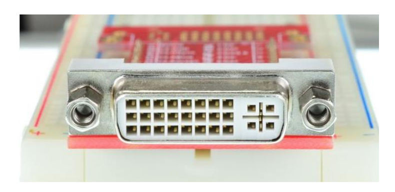
Figure 4: DVI-IF-IF-V1A front view