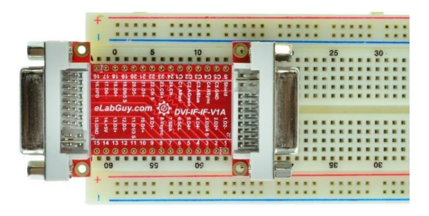
Figure 2: Example of connecting the DVI-IF-IF-V1A on a breadboard (Note: This picture only shows the pins spacing, actual use may not be used on a breadboard)