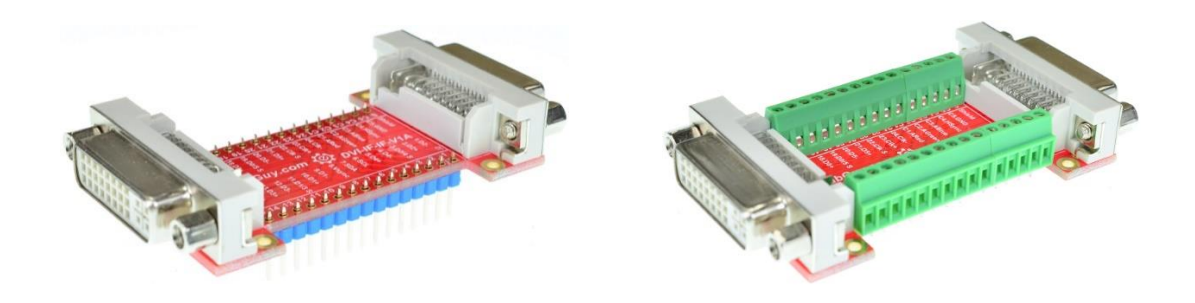
Figure 3: DVI-IF-IF-V1A Various connections